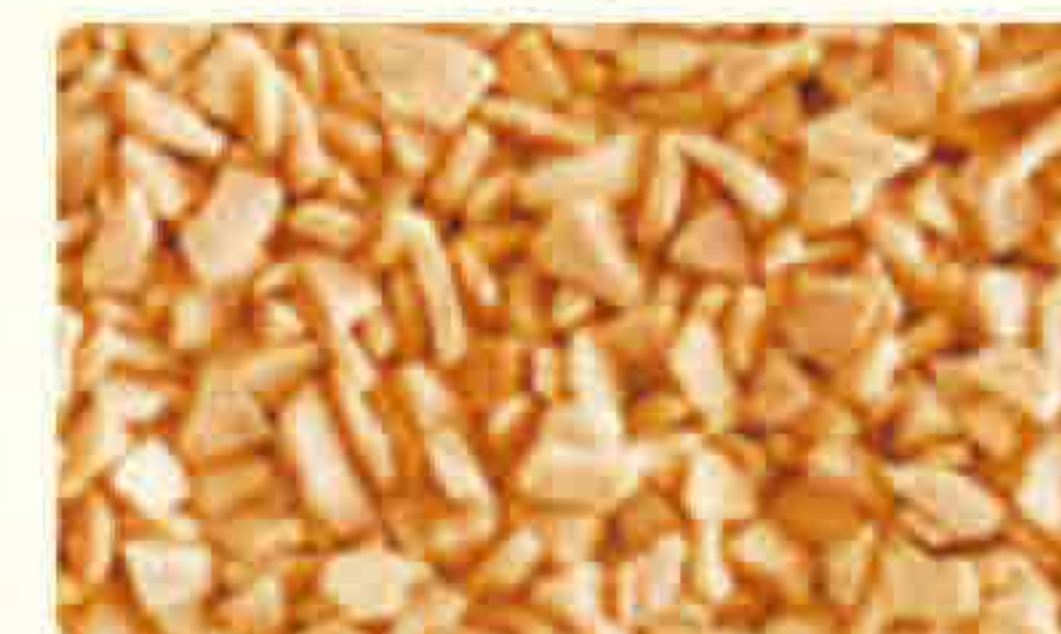
Fried Garlic Granule