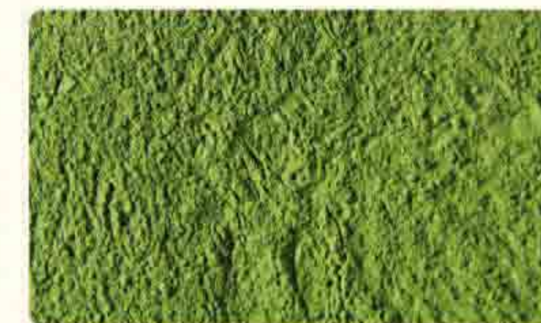
AD Spinach Powder