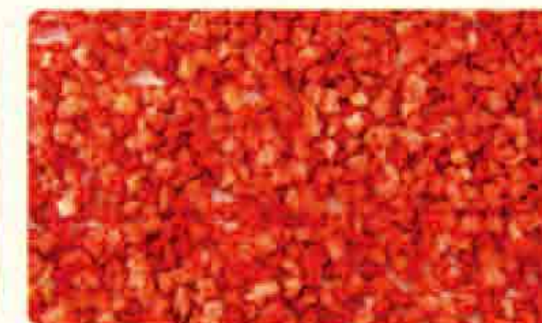
FD Strawberry Diced