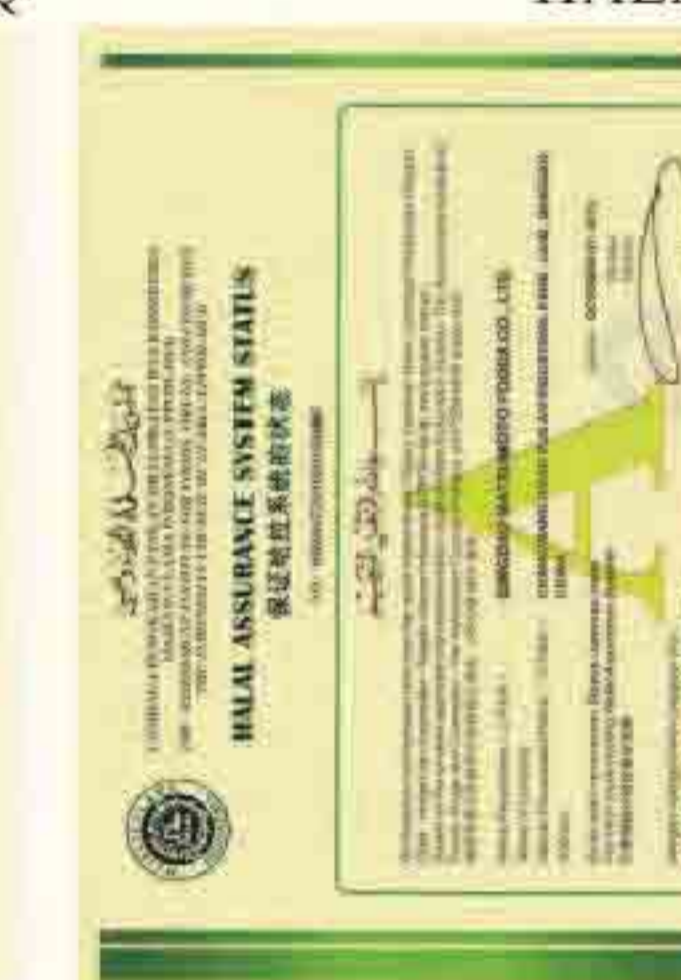
HALAL BY MUI