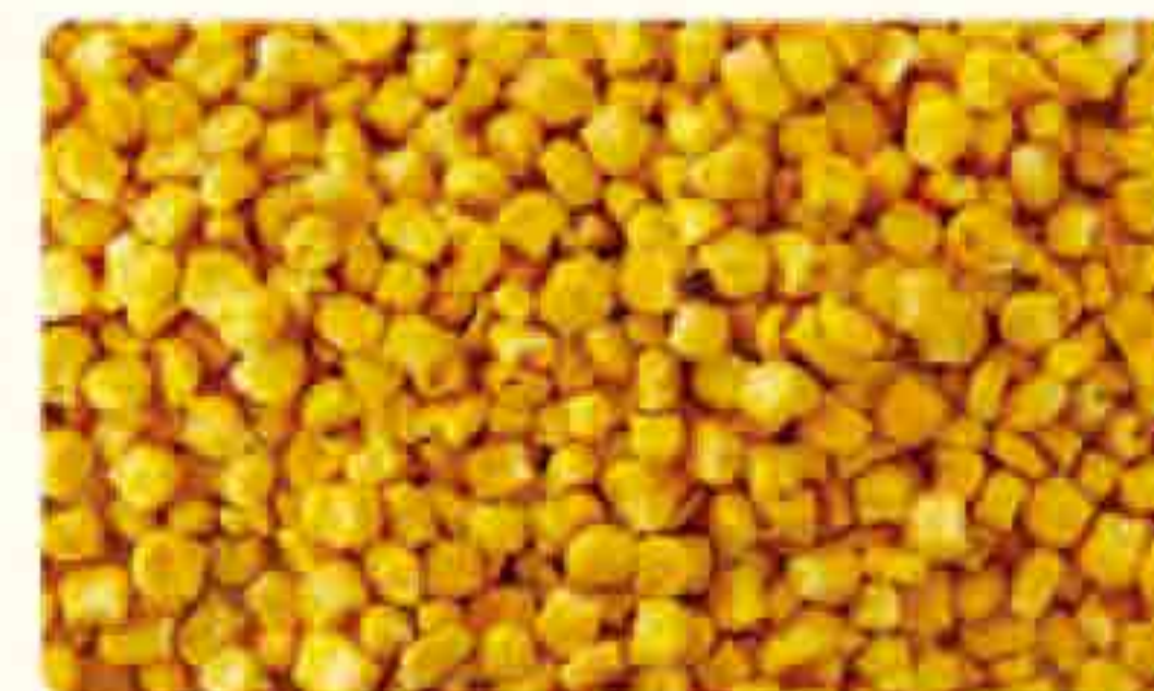
FD Sweet corn