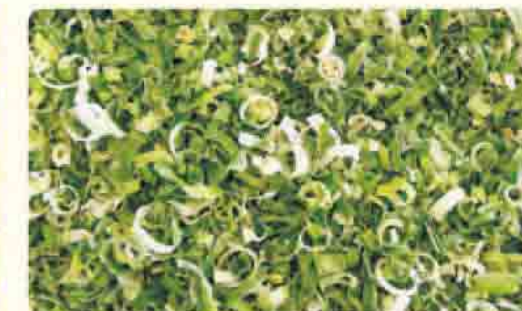
AD Spring Onion (Leek)