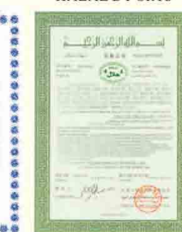
HALAL BY SIAC