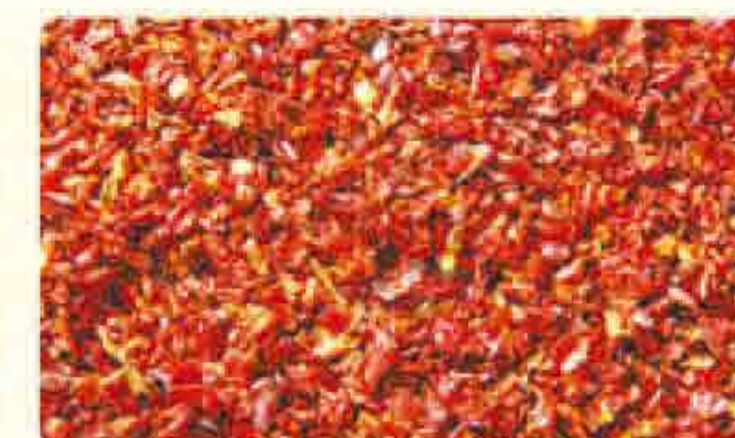
AD Red Bell Pepper Flakes