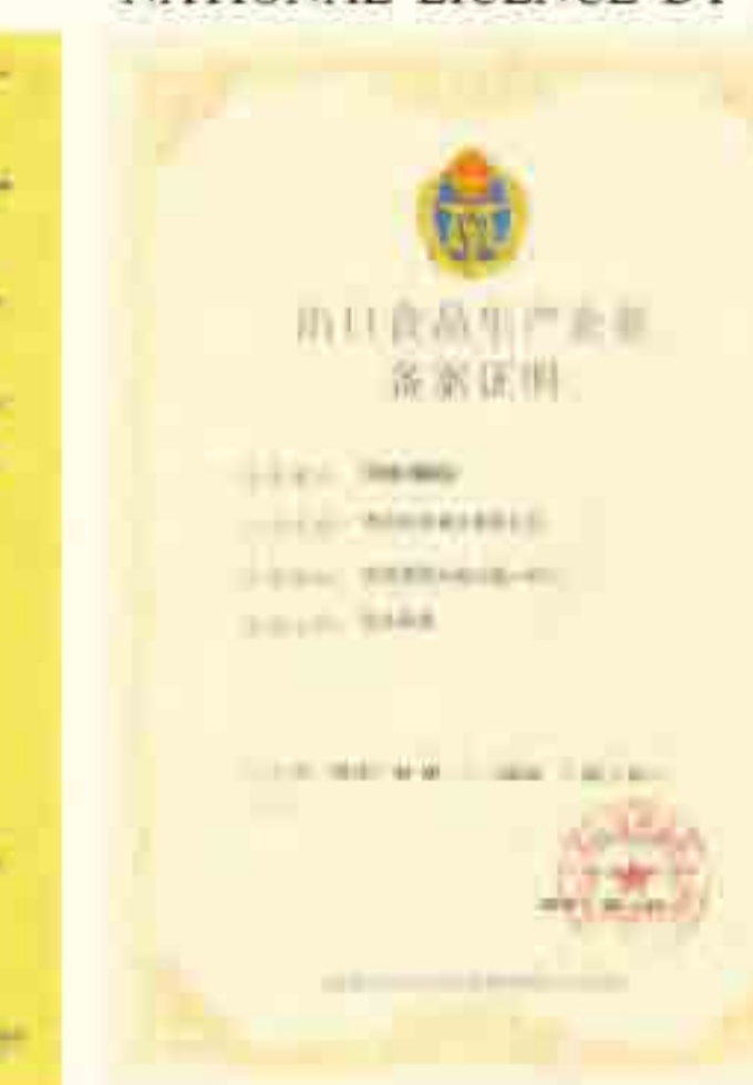
NATIONAL LICENCE BY CIQ