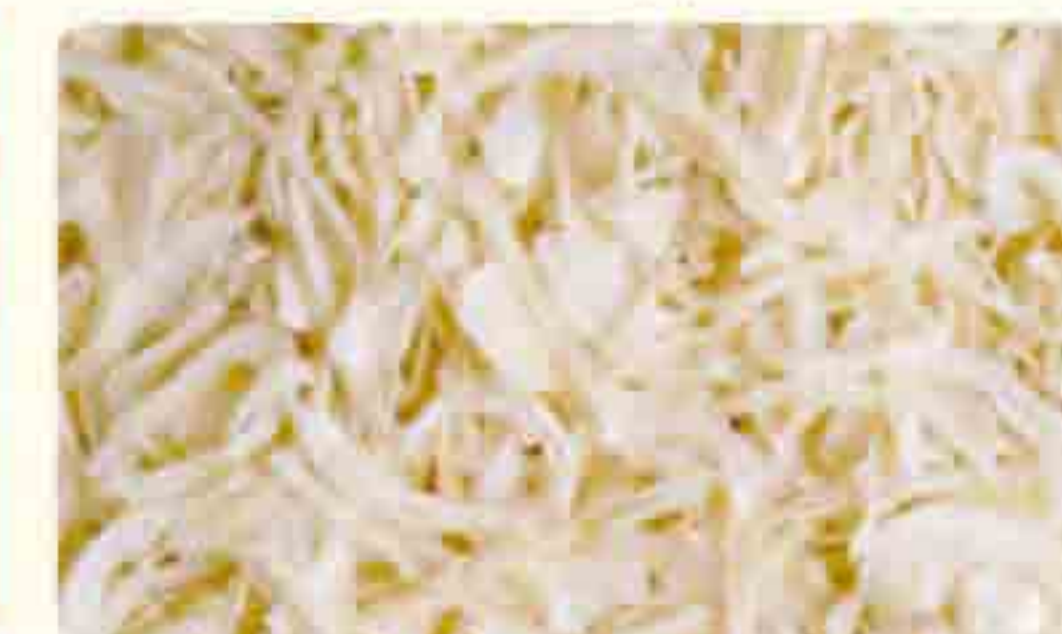
AD Onion Kibble