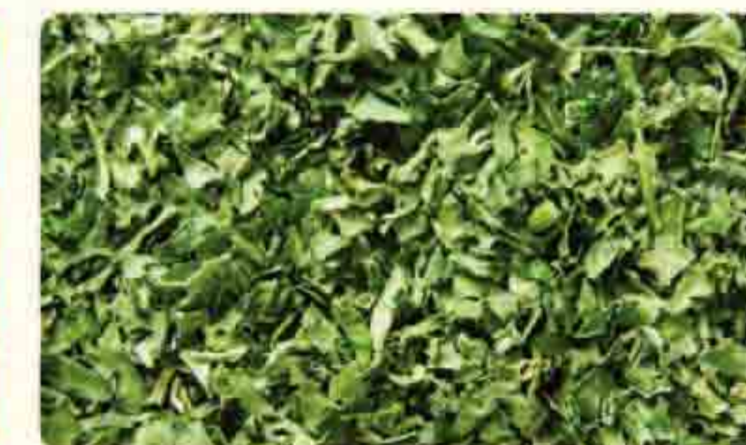
AD Spinach Flakes