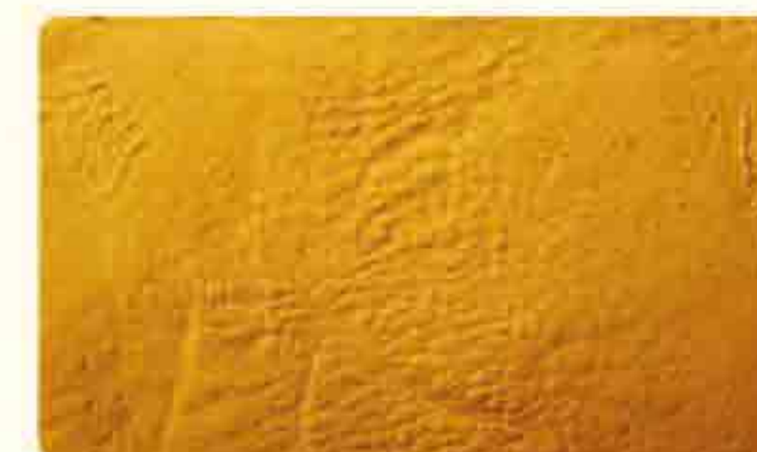
Spray Dried Soy Sauce Powder