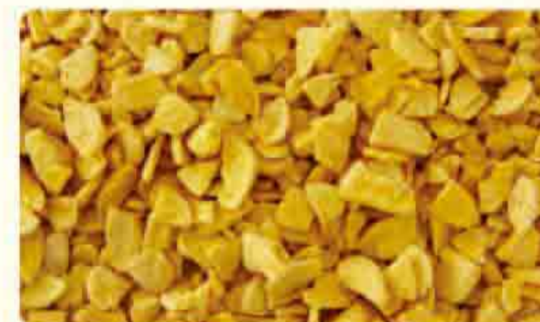
FD Banana Sliced